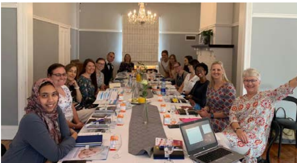
ADSA Eastern Cape Roadshow

knowledge and experience in a presentation titled 'The Past, Present and Future of the dietetic profession in South Africa', with an update on the new nutrition professional.