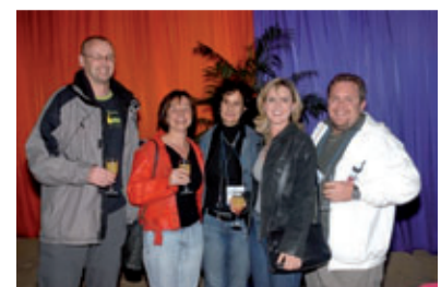
Scenes from the Nutrition Congress 2006.